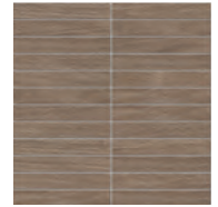
1 x 6 Stacked Mosaic Mounted on a 297 x 290 sheet