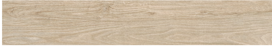
RRL01 ▶ Daybreak