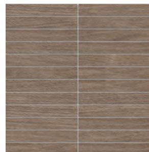
1 x 6 Stacked Mosaics (available in all colors)