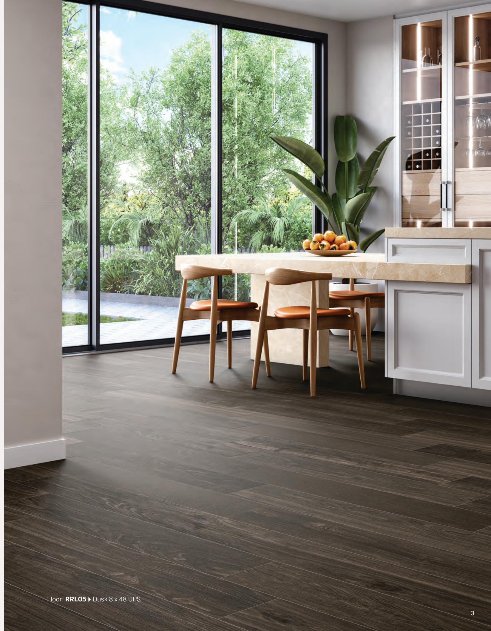
Floor: RRLO5 ▶ Dusk 8 x 48 UPS