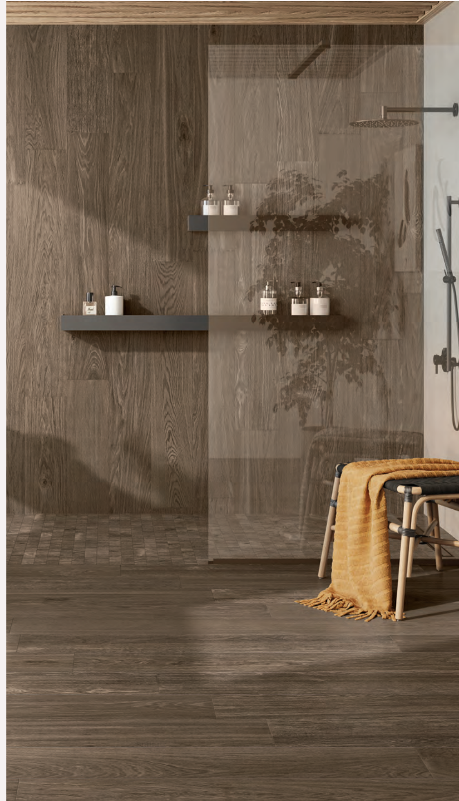
Floor: RRLO3 ▶ Midday 8 x 48 UPS and Shower Floor: RRLO3 ▶ Midday 2 x 4 Stacked Mosaics UPS