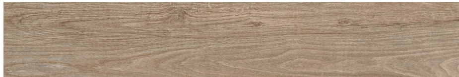
RRL02 ▶ Sunrise