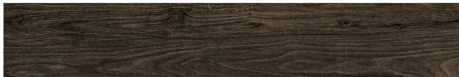
RRL05 ▶ Dusk