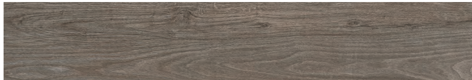
RRL04 ▶ Twilight