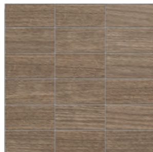
2 x 4 Stacked Mosaics (available in all colors)