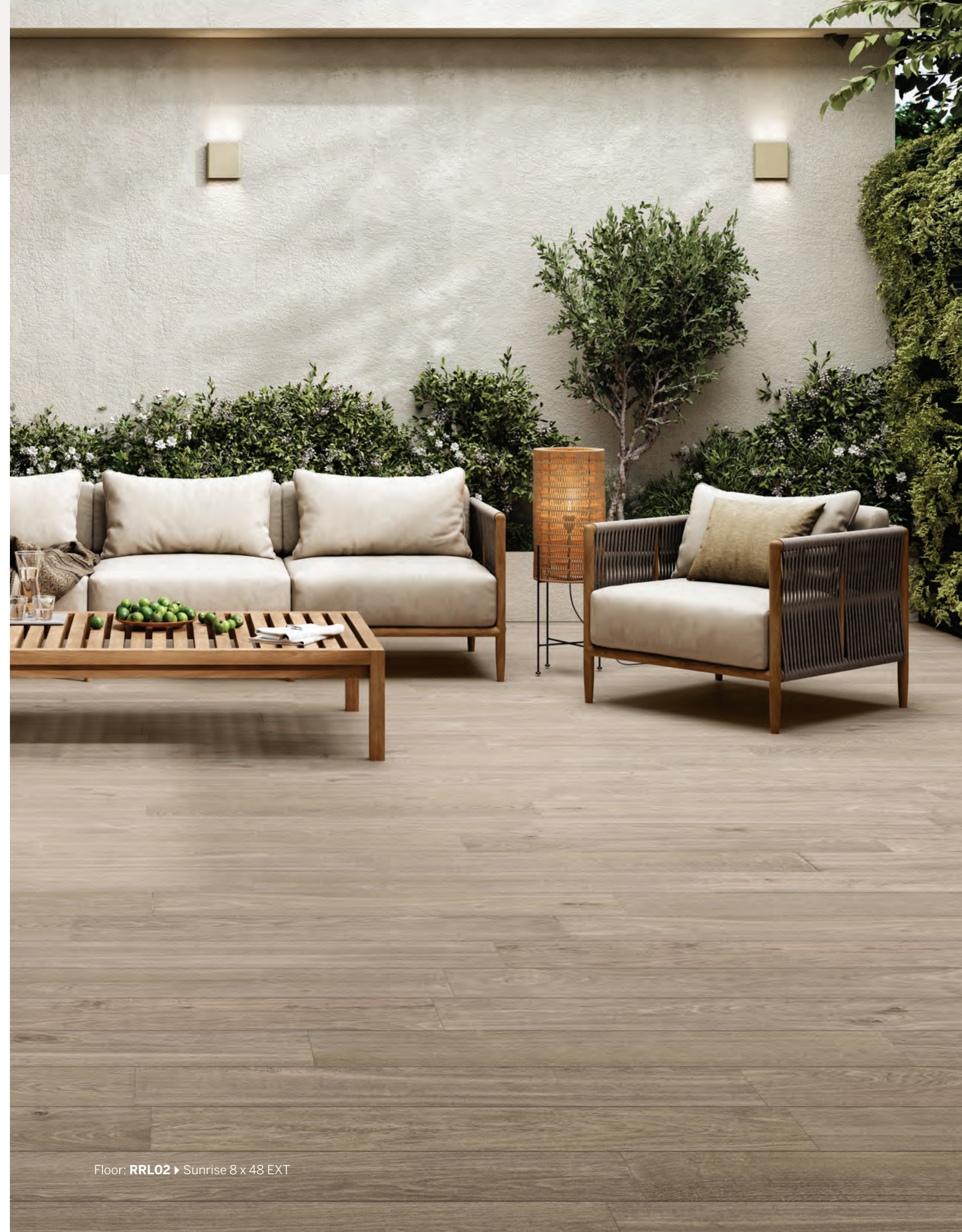
Floor: RRL02 ▶ Sunrise 8 x 48 EXT