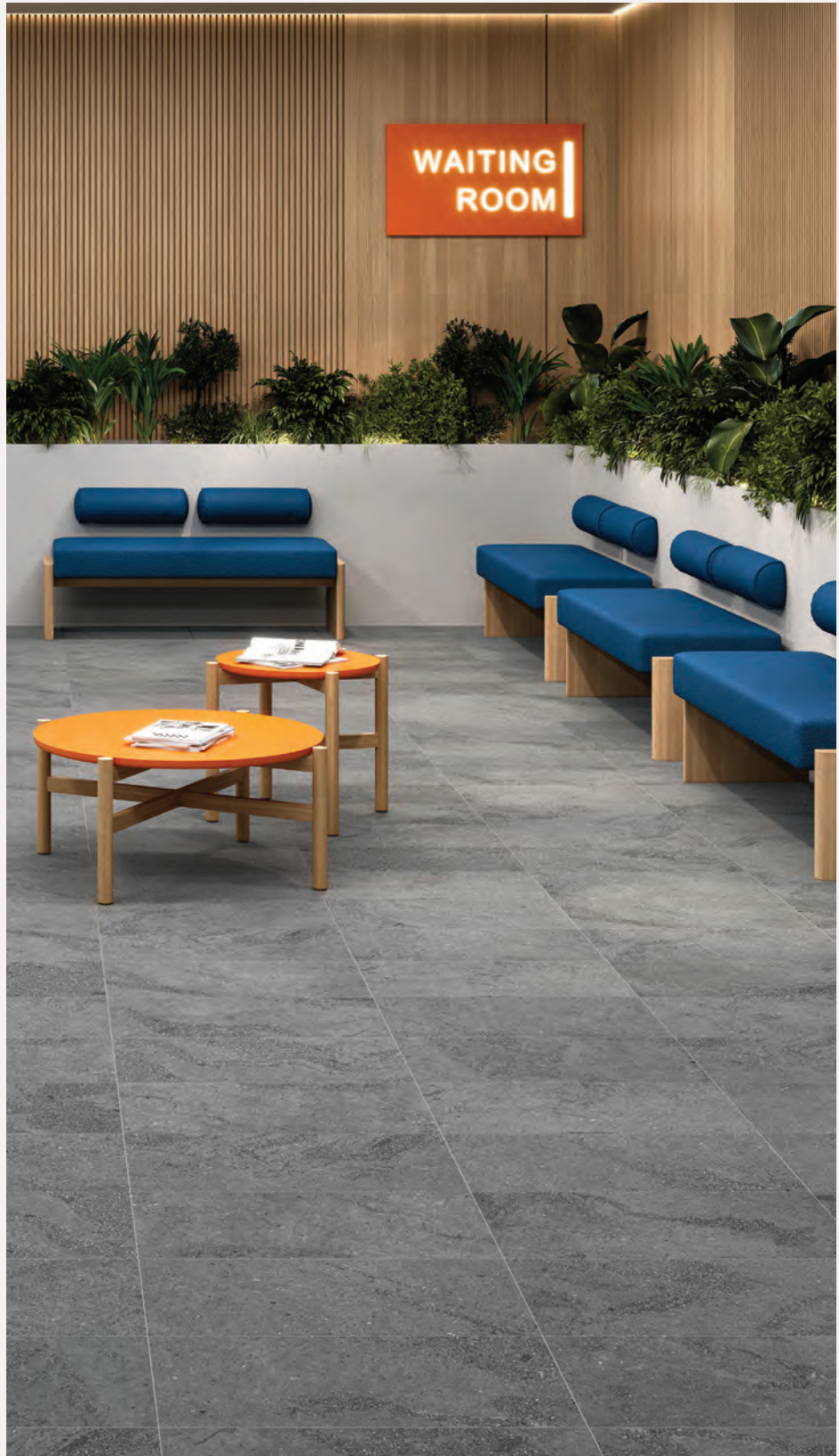
Floor: TRY03 ▶ Flight 12 x 24 UPS