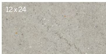
12 x 24