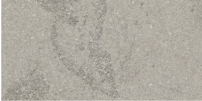
TRY01 ▶ Path