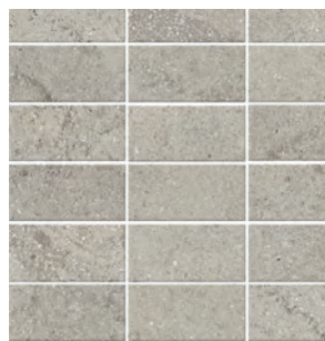
2 x 4 Stacked Mosaics (available in all colors)