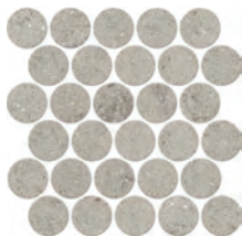
2.5 Diameter Circle Mosaic