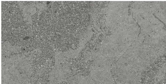
TRY03 ▶ Flight