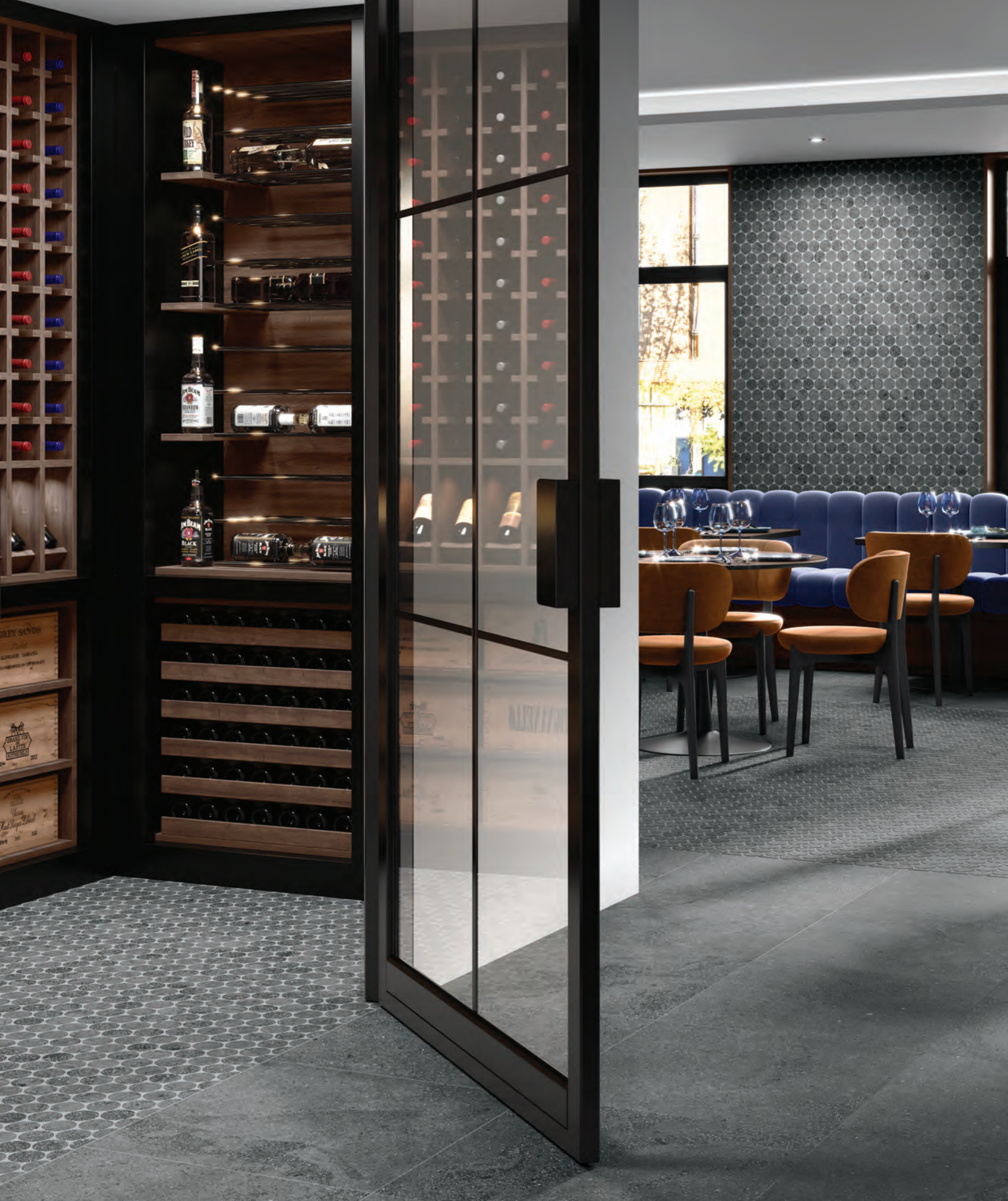
Floor: TRY04 ▶ Flow 12 x 24 UP and 2.5D Circle Mosaic Back Wall: TRY04 ▶ Flow 2.5D Circle Mosaic