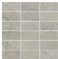
2 x 4 Stacked Mosaic