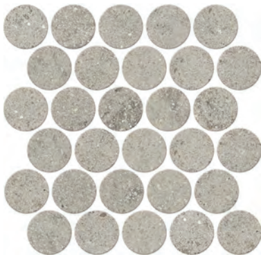
2.5 Diameter Circle Mosaics (available in all colors)