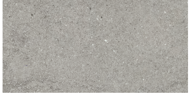
TRY02 ▶ Direction