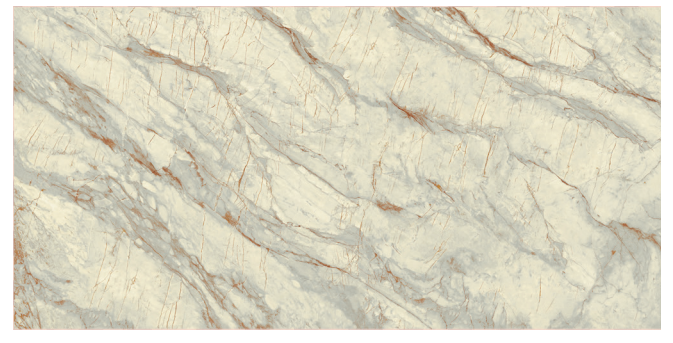
MBQ01 ▶ Van Gogh White