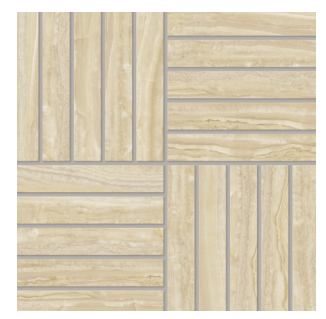
1 x 6 Alternating Mosaic (Available in all color and mounted on a 297 x 297 mm sheet)