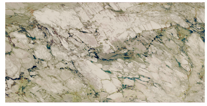
MBQ02 ► Breccia Capraia