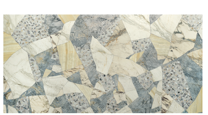
MBQBL.12448UP > 24 x 48 Blended Deco