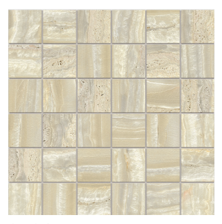
3 x 3 Square Mosaic (Available in all color and mounted on a 297 x 297 mm sheet)