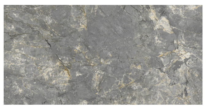
MBQ03 ► Invisible Grey