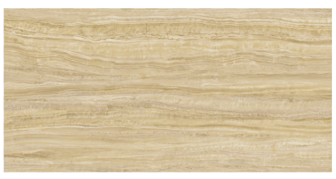
MBQ04 ► Onice Verde