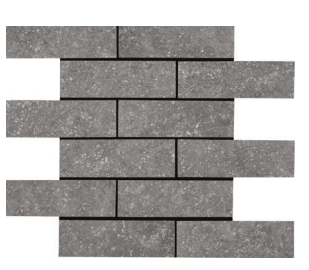
BJN04 > Canal Gray 2 x 6 Brick Mosaic