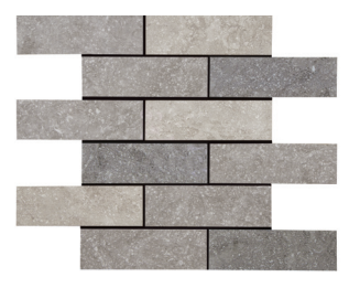
BJNBM.10206UMOS > Medium Blend 2x6 Brick Mosaic BJN03, BJN02, BJN04