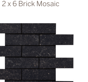
BJN05 ► Black Iron 2 x 6 Brick Mosaic