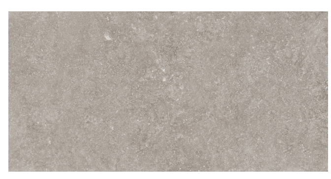
BJN02 ► Platinum Solitaire