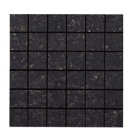
BJN05 ▶ Black Iron 2 x 2 Square Mosaic