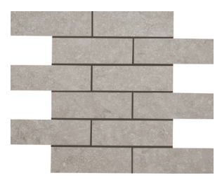
BJN02 Platinum Solitaire 2 x 6 Brick Mosaic