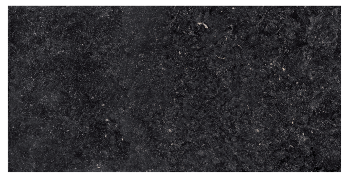
BJN05 ► Black Iron