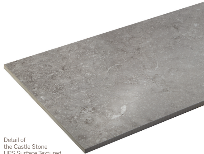
UPS Surface Textured