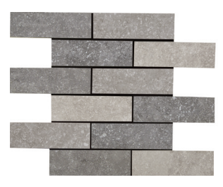
BJNBD.10206UMOS > Dark Blend 2x6 Brick Mosaic BJN04, BJN02, BJN03