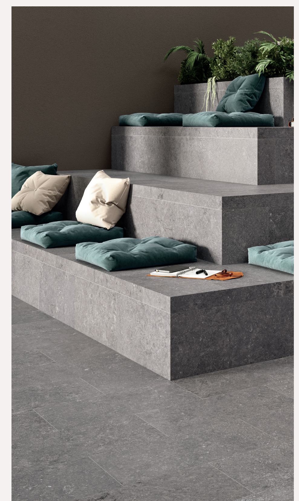
Steps: BJN04 BJN04 Canal Gray 12 x 24 UPS Floor: BJN04 BJN04 Canal Gray 12 x 24 UPS