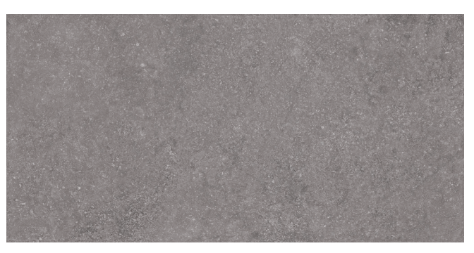
BJN04 ► Canal Gray