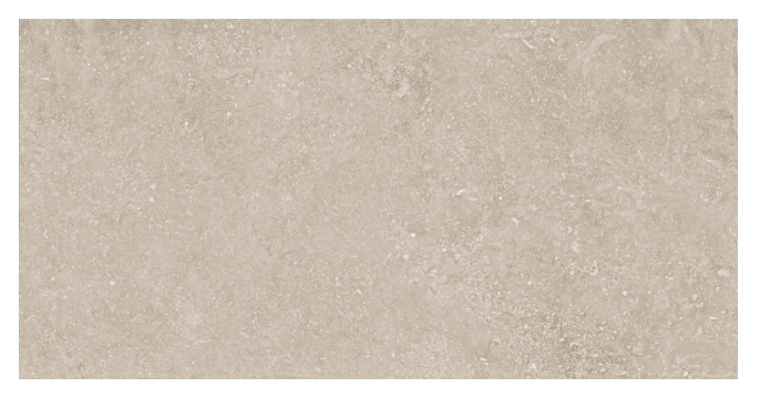
BJN01 ► Toasted Waffle