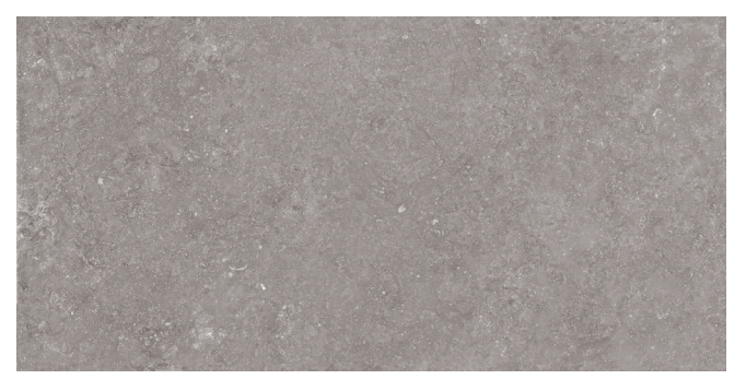
BJN03 ► Castle Stone