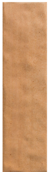
COM03 ▶ Naranja 3 x 10 Undulating Wall Brick*