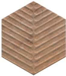
8" Chevron Hex