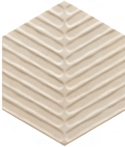
COM01 ▶ Blanco 8" Chevron Hex