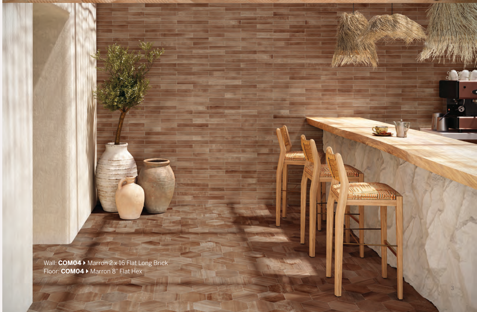
Wall : COM04 ▶ Marron 2 x 16 Flat Long Brick Floor : COM04 ▶ Marron 8" Flat Hex