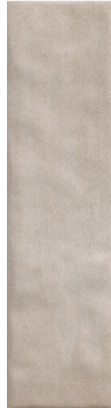
COM02 ▶ Taupe 3 x 10 Undulating Wall Brick*