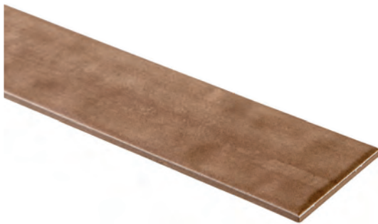
Detail of the Marron 3 x 10 Undulating Wall Tile Surface