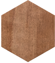
8" Flat Hex