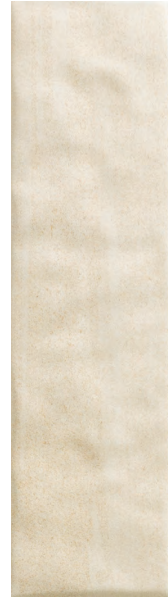
COM01 ▶ Blanco 3 x 10 Undulating Wall Brick*