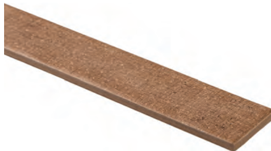
Detail of the Marron 2 x 16 Long Brick Surface