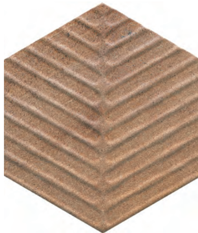
COM04 ▶ Marron 8" Chevron Hex