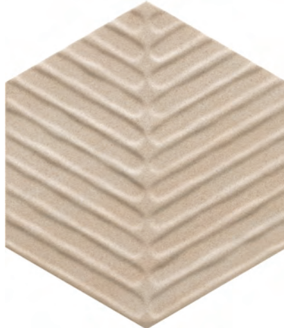
COM02 ▶ Taupe 8" Chevron Hex