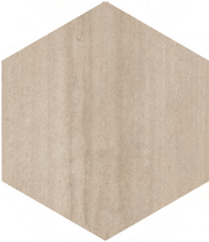
COM02 ▶ Taupe 8" Flat Hex