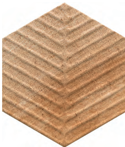
COM03 ▶ Naranja 8" Chevron Hex