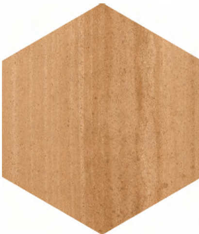
COM03 ▶ Naranja 8" Flat Hex