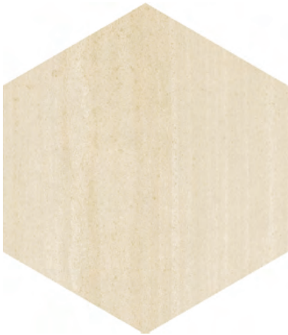
COM01 ▶ Blanco 8" Flat Hex