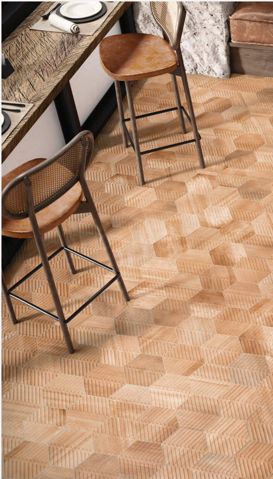
COM03 ▶ Naranja 8" Chevron Hex

Available in four clay and terracotta tones, Cotto Moderno is anything but traditional. The bohemian style and artisanal make up of each unique tile bring nature's energy to your vision.