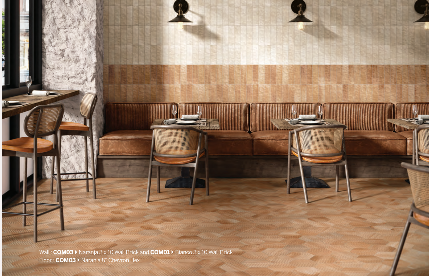
Wall : COM03 ▶ Naranja 3 x 10 Wall Brick and COM01 ▶ Bianco 3 x 10 Wall Brick Floor : COM03 ▶ Naranja 8" Chevron Hex