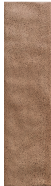
COM04 ▶ Marron 3 x 10 Undulating Wall Brick*