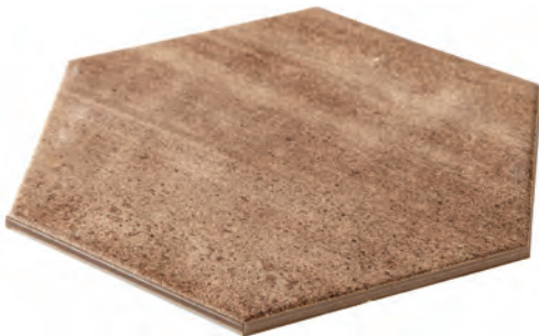
Detail of the Marron Flat Hex Surface