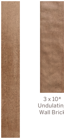
2 x 16 Flat Long Brick