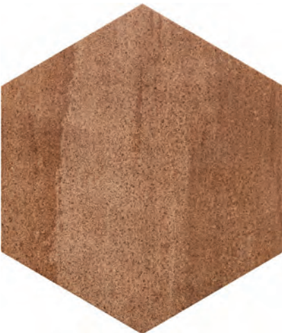
COM04 ▶ Marron 8" Flat Hex