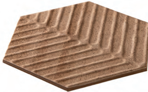
Detail of the Marron Chevron Hex Surface