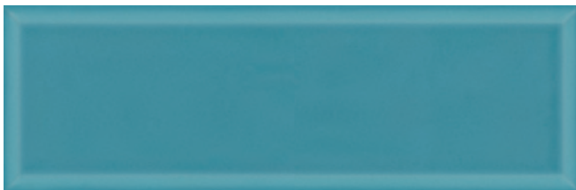
CPR07 ▶ Topaz