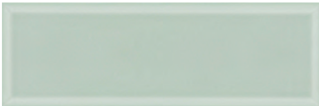
CPR05 ▶ Tea