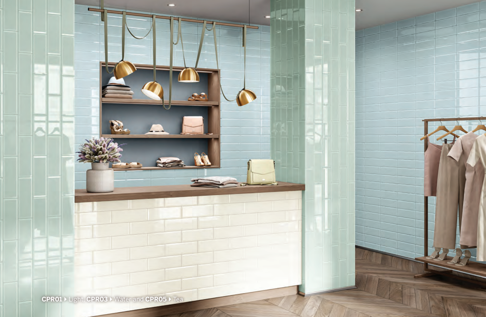
CPR01 ▶ Light, CPR03 ▶ Water and CPR05 ▶ Tea