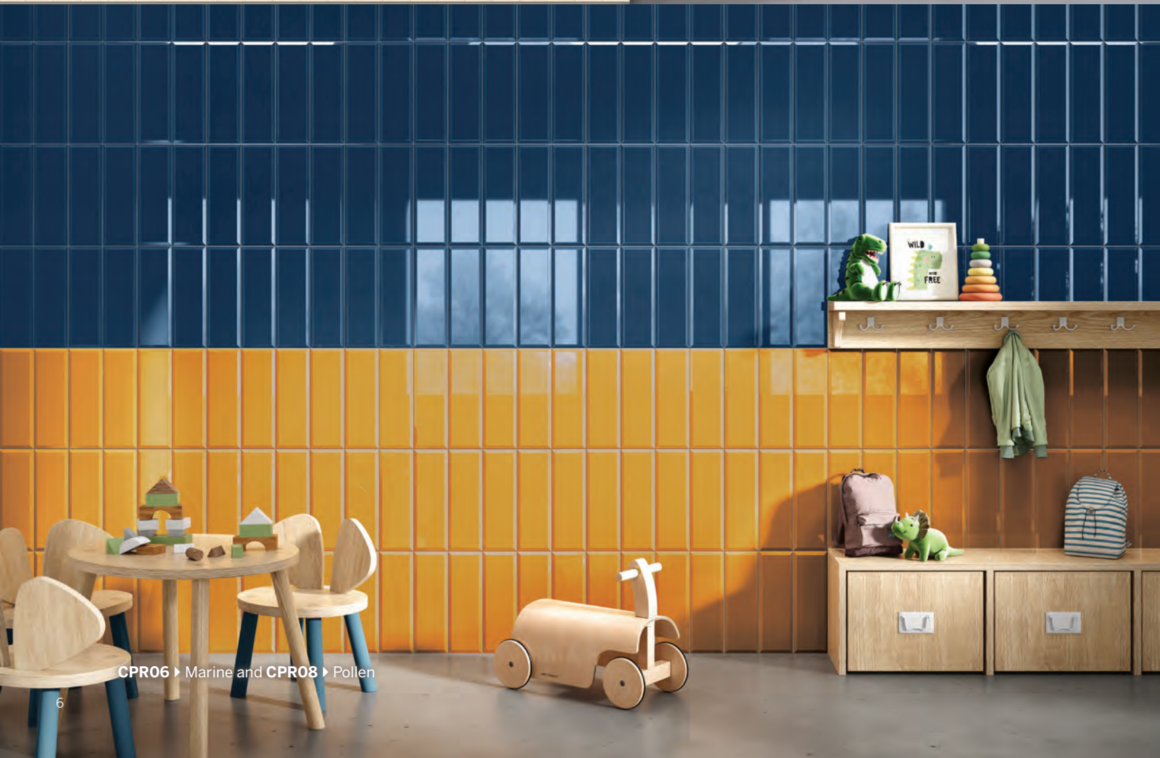
CPR06 ▶ Marine and CPR08 ▶ Pollen