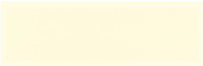
CPR04 ▶ Vanilla