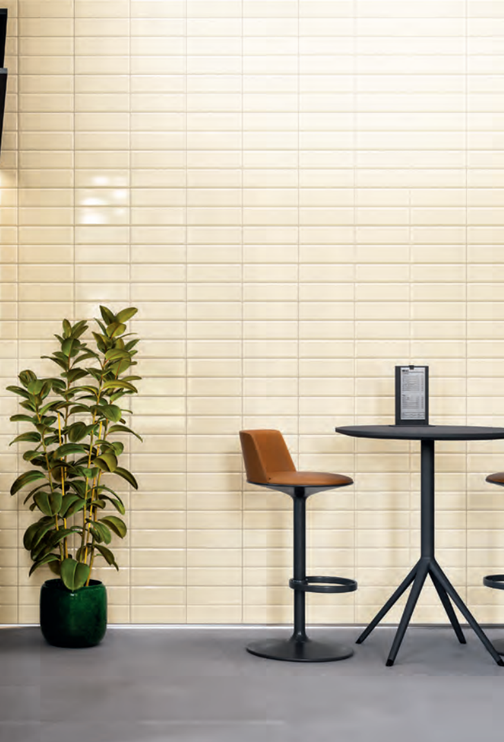
Wall: CPR04 ▶ Vanilla