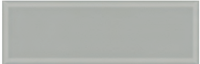
CPR02 ▶ Coin