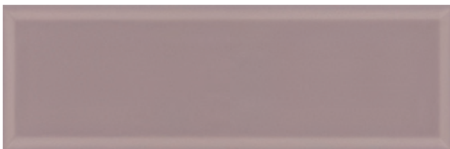
CPR09 ▶ Viola