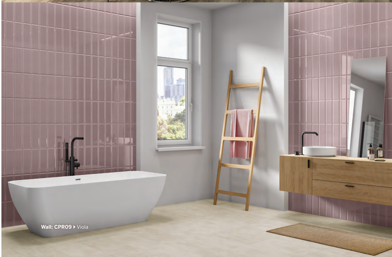
Wall: CPR09 ▶ Viola