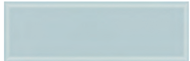
CPR03 ▶ Water