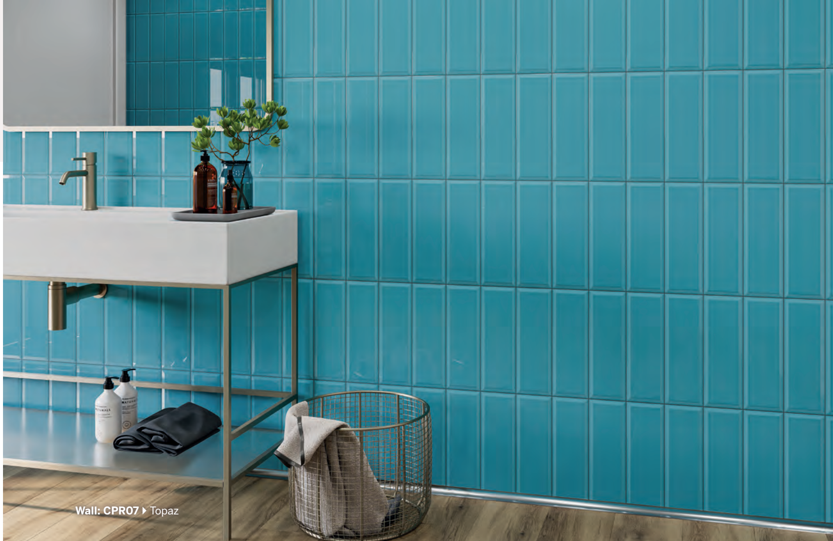
Wall: CPR07 ▶ Topaz