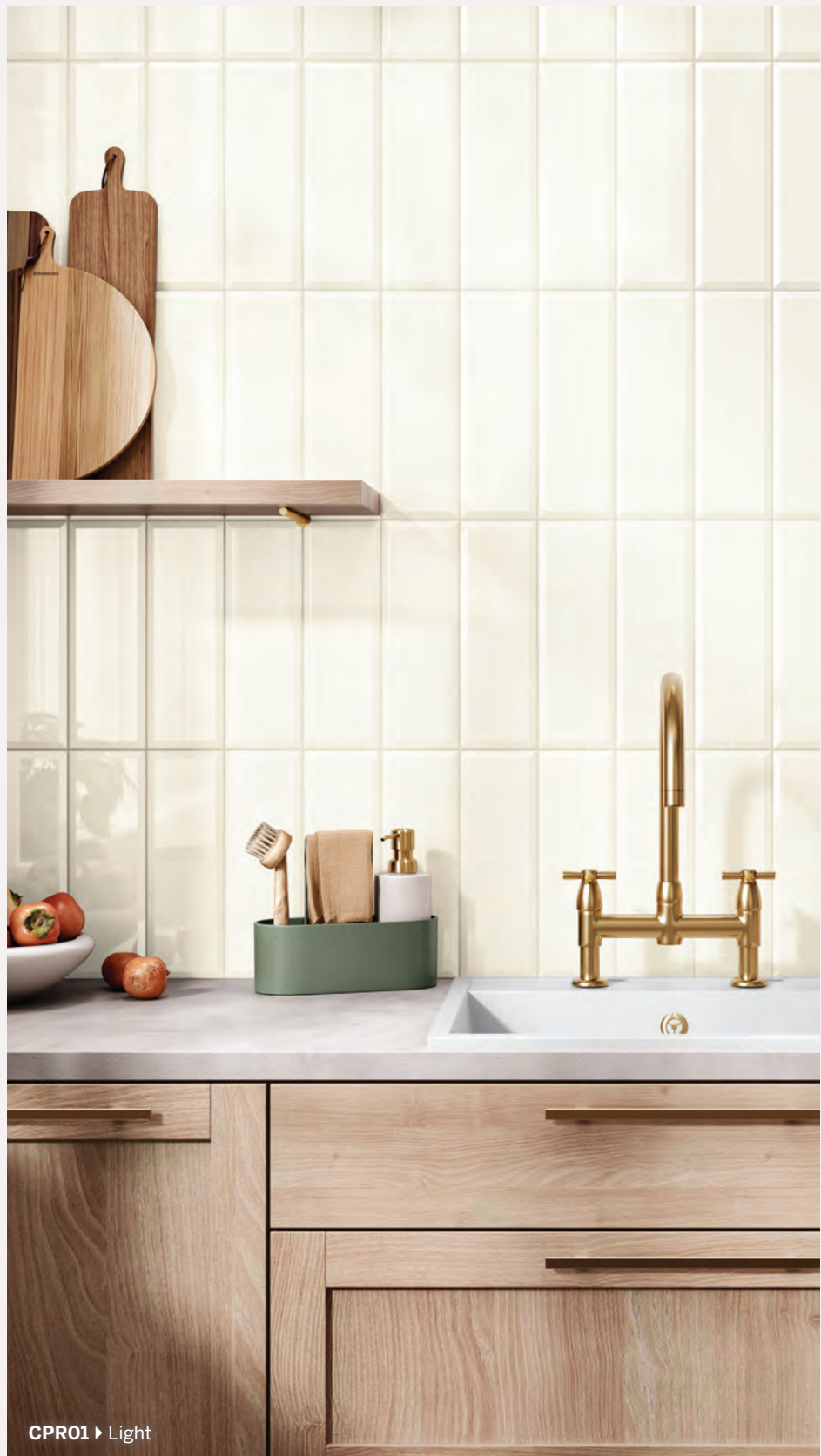
CPR01 ▶ Light

Define your projects' point of view with Color Perspectives, wall tile only from Crossville.