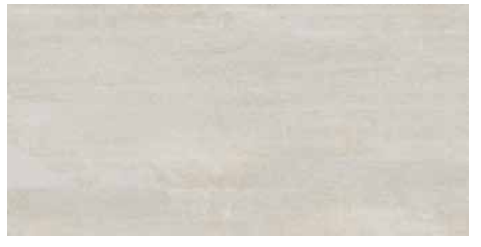
NVM01 ► Noble Platinum