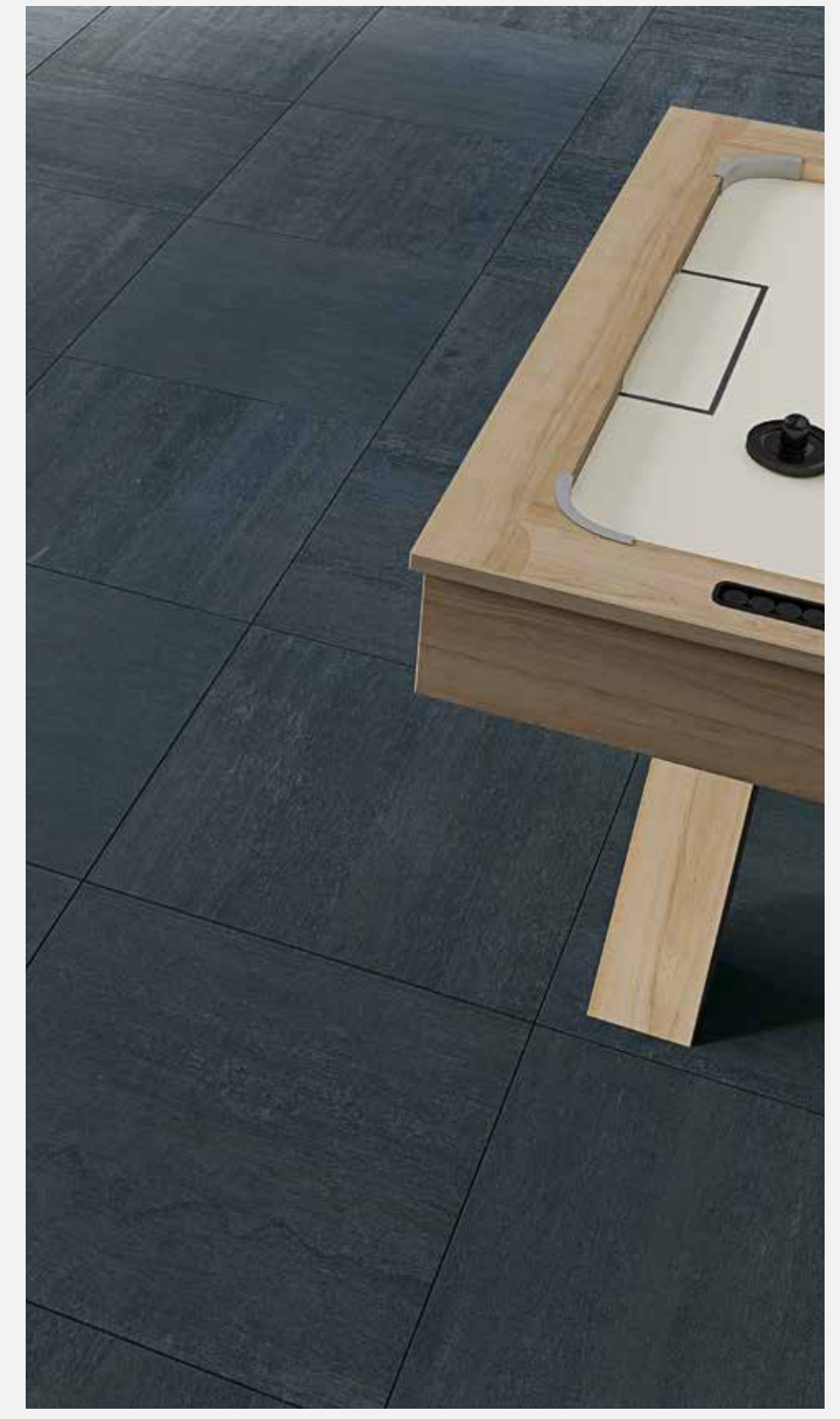
NVM05 ► Cobalt Ore 24x24