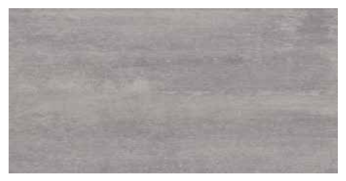
NVM03 ► Crucible Steel