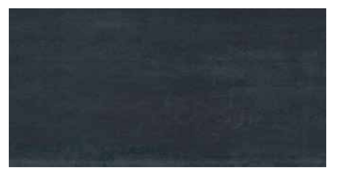
NVM05 ► Cobalt Ore