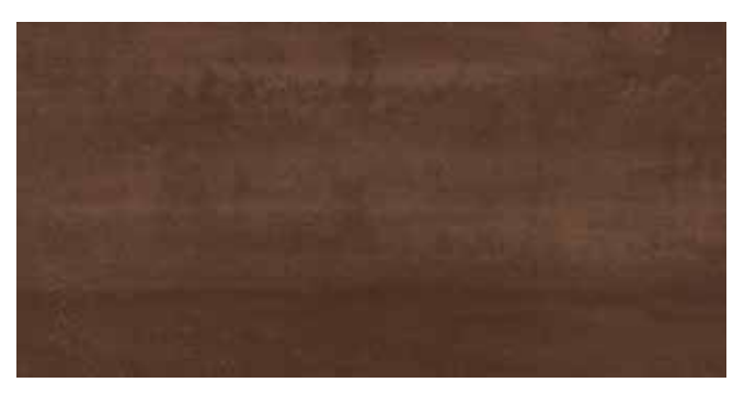
NVM04 ► Copper Deposit