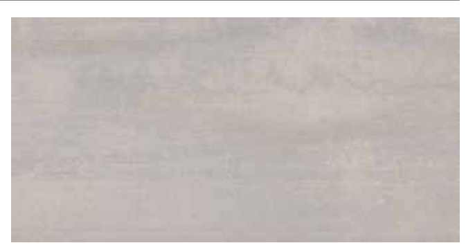
NVM02 ► Nickel Plate