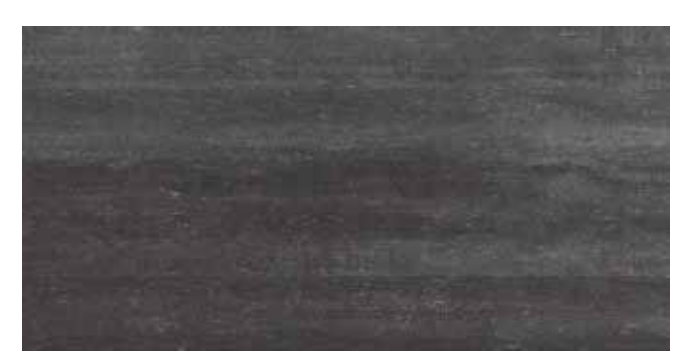
NVM06 ► Graphite Black