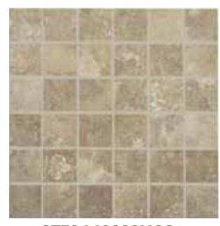
STF04.10202MOS ► Travertine Coffee 2 x 2 Mosaic