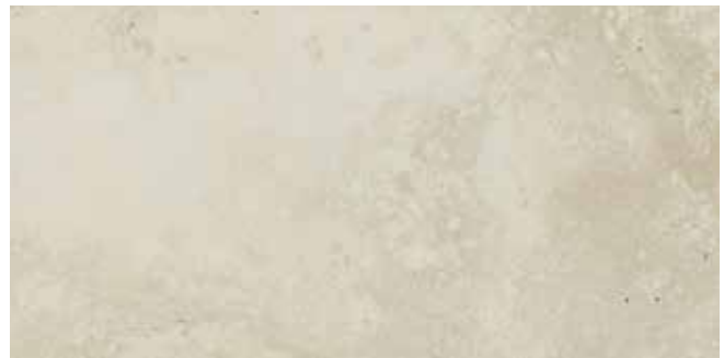
STF01 ▶ Travertine Ivory