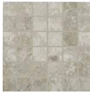
STF03.10202MOS ► Travertine Silver 2 x 2 Mosaic