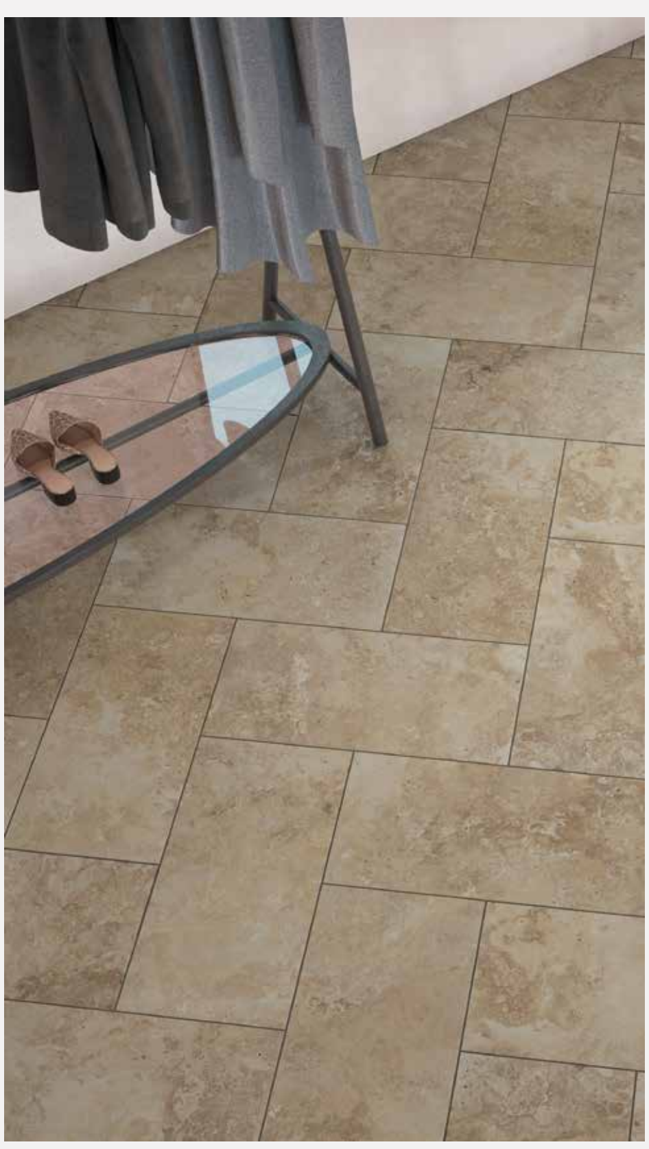
Floor: STF04 ▶ Travertine Coffee 12 x 24 UPS