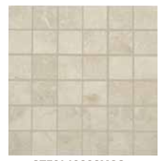
STF01.10202MOS ► Travertine Ivory 2 x 2 Mosaic