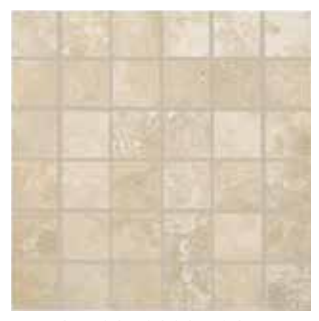
STF02.10202MOS ► Travertine Beige 2 x 2 Mosaic