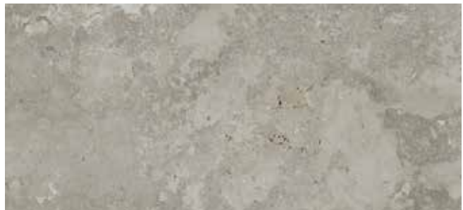
STF03 ▶ Travertine Silver