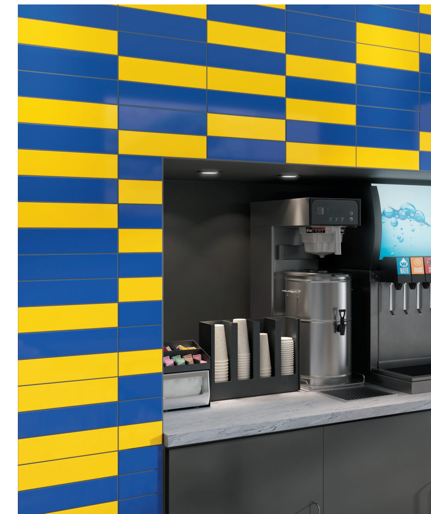
BRI21 ▶ Cobalt 3 x 12 Gloss BRI24 ▶ Pineapple 3 x 12 Gloss

Information listed here is subject to change. Please refer to CrossvilleInc.com for the latest, most accurate information.