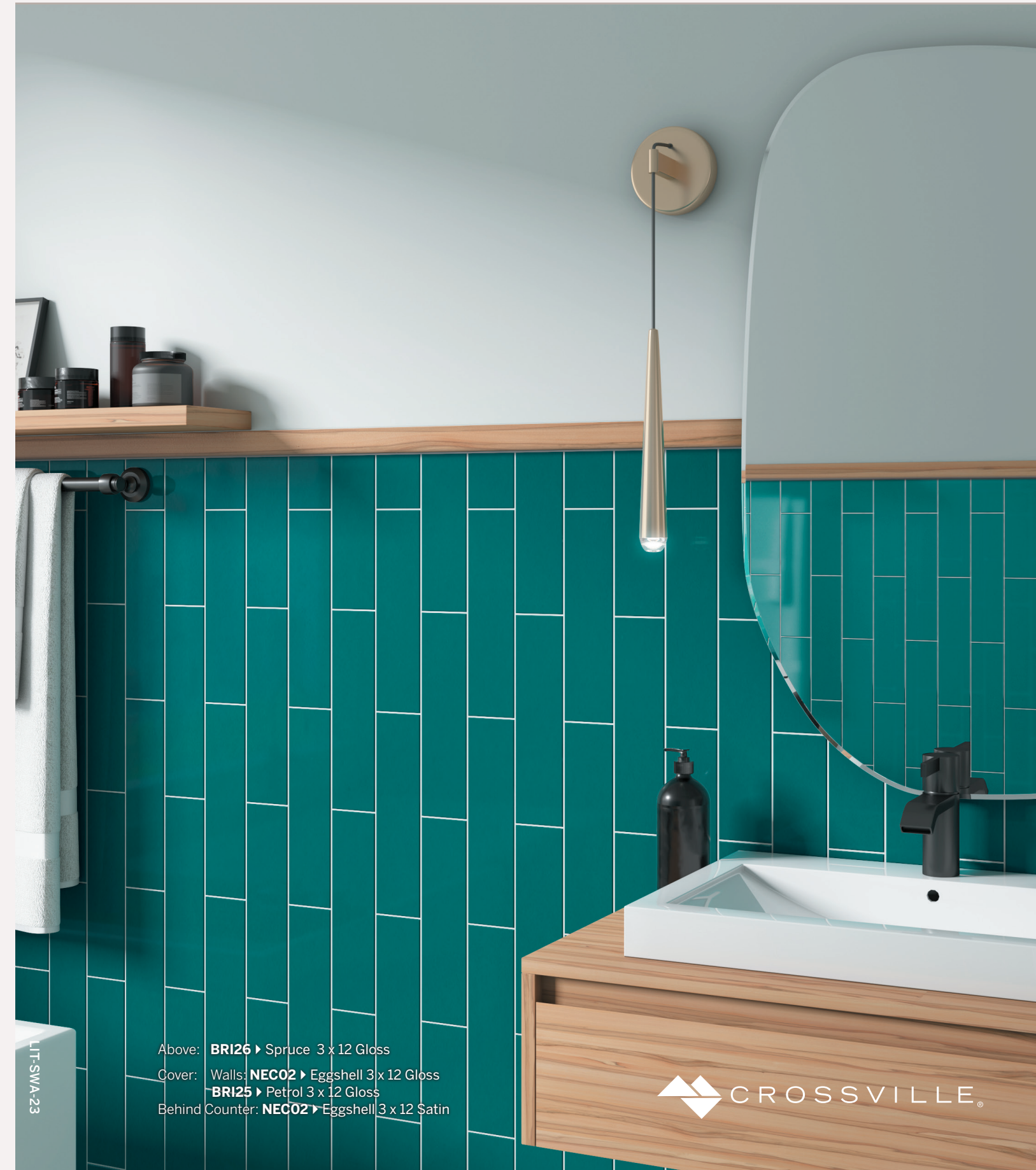
Above: BRI26 ▶ Spruce 3 x 12 Gloss Cover: Walls: NEC02 ▶ Eggshell 3 x 12 Gloss BRI25 ▶ Petrol 3 x 12 Gloss Behind Counter: NEC02 ▶ Eggshell 3 x 12 Satin