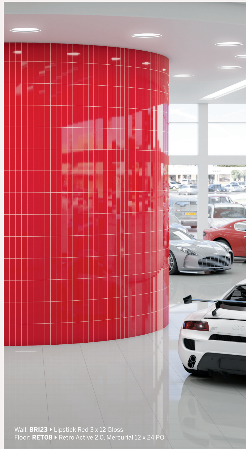
Wall: BRI23 ▶ Lipstick Red 3 x 12 Gloss Floor: RET08 ▶ Retro Active 2.0, Mercurial 12 x 24 PO

Amplify your color swatch by mixing and matching with Snippet, Crossville's 3"x12" wall tile featuring a distinctive left and right triangle pattern. Snippet is a perfect little match for Cotton, Stone, Warm Silver, Lipstick Red, and Coal and Swatches field tile can help you create even more patterns for a dramatic wallscape distinct to your design.