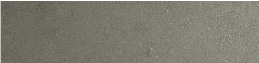
Roccia - L3916 - 5.6 (Floors & Walls) - Stocking