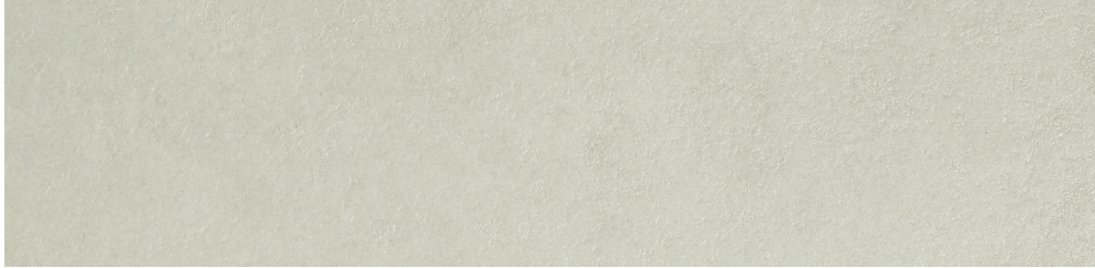
Sale - L3914 - 5.6 (Floors & Walls) - Stocking

Note! These samples depict base color and sheen. Please refer to our website for a more accurate depiction of veining and pattern. *See chart on the next page for further information