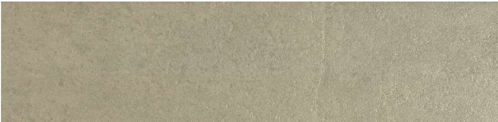
Rena - L3917 - 5.6 (Floors & Walls) - Stocking