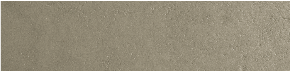
Terra - L3915 - 5.6 (Floors & Walls) - Stocking