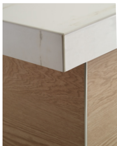
3+ and 5.6mm Using Profiles