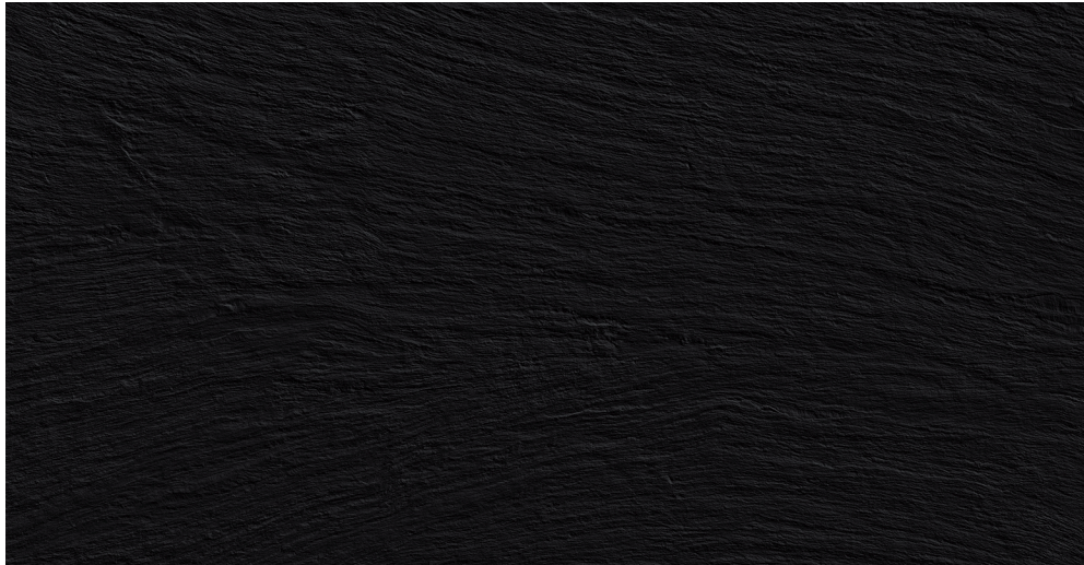
Nero - L9758 5+ Stocking

For over 2,500 years, Pietra di Lavagna slate from Liguria, Italy has been revered as an elegant, sophisticated surfacing material. Honoring this traditional stone, our artisans were inspired to create a naturally clefted slate look—Ardesia a Spacco, a porcelain panel unlike any other. The result is a superior performing panel with strength and resilience found only in porcelain.