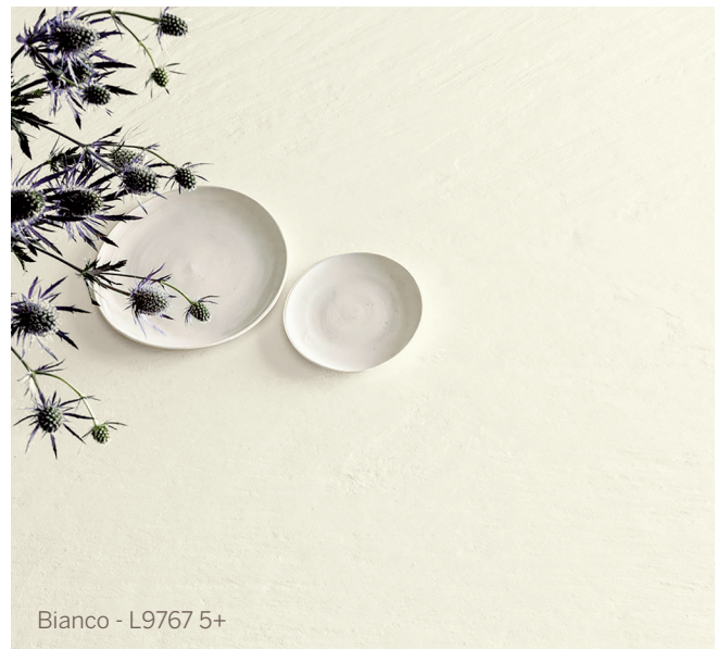
Bianco - L9767 5+