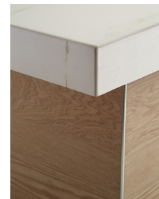
5.6mm Back Mitered and Epoxied