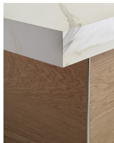
5.6mm Field Applied Bullnose