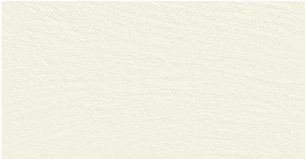
Bianco - L9767 5+ Stocking

Note! These samples depict base color and sheen. Please refer to our website for a more accurate depiction of veining and pattern. *See chart on the next page for further information