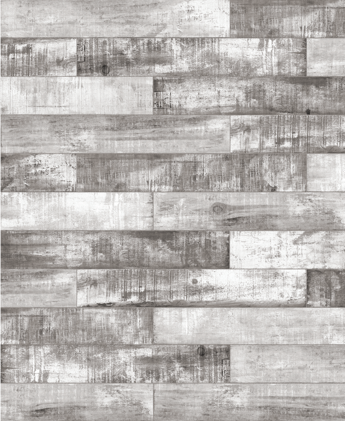
6" x 36" RECLAIMED ASH HD PORCELAIN TILE