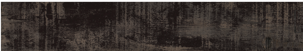
6" x 36" RECLAIMED CHARRED HD PORCELAIN TILE 62-740