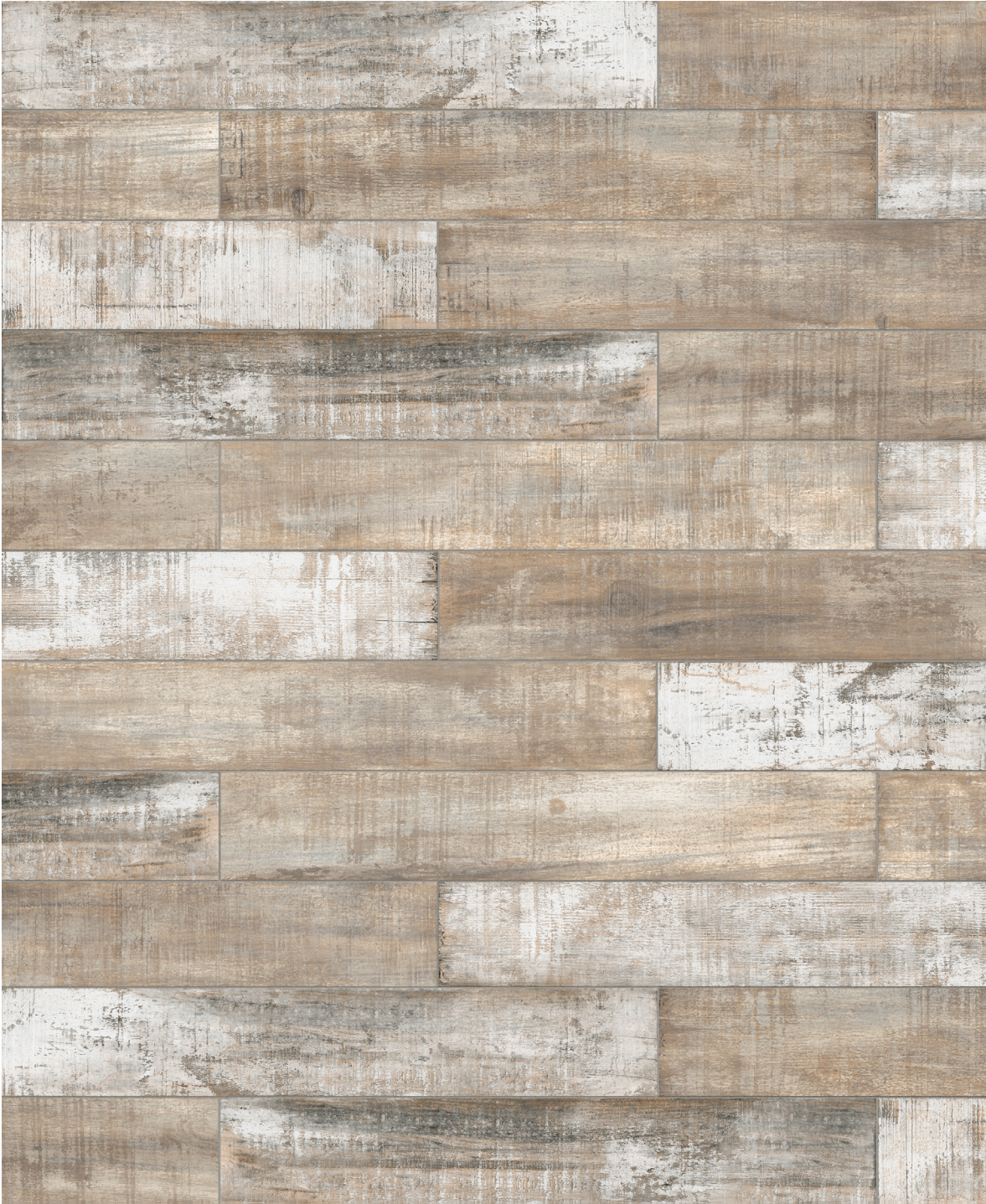
6" x 36" RECLAIMED SADDLE HD PORCELAIN TILE