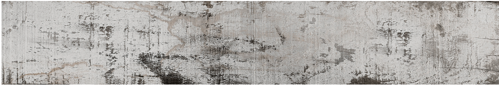
6" x 36" RECLAIMED SMOKE HD PORCELAIN TILE 62-738