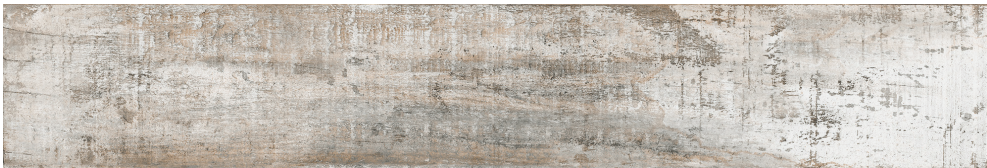
6" x 36" RECLAIMED SADDLE HD PORCELAIN TILE 62-739