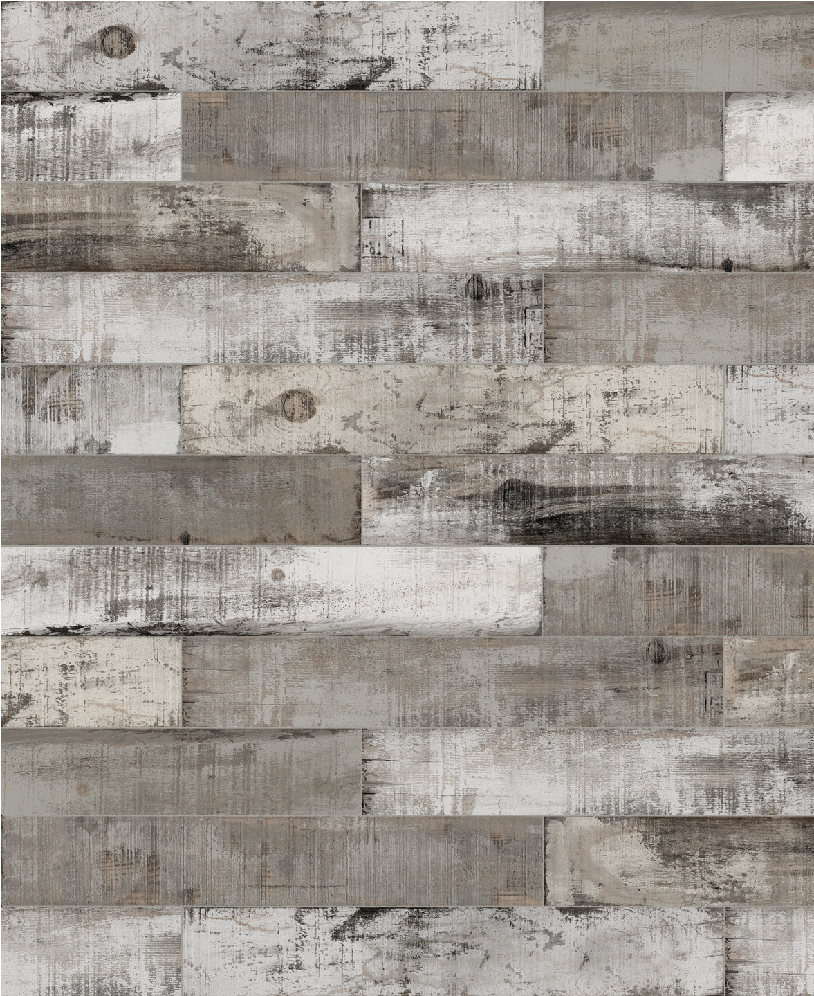
6" x 36" RECLAIMED SMOKE HD PORCELAIN TILE