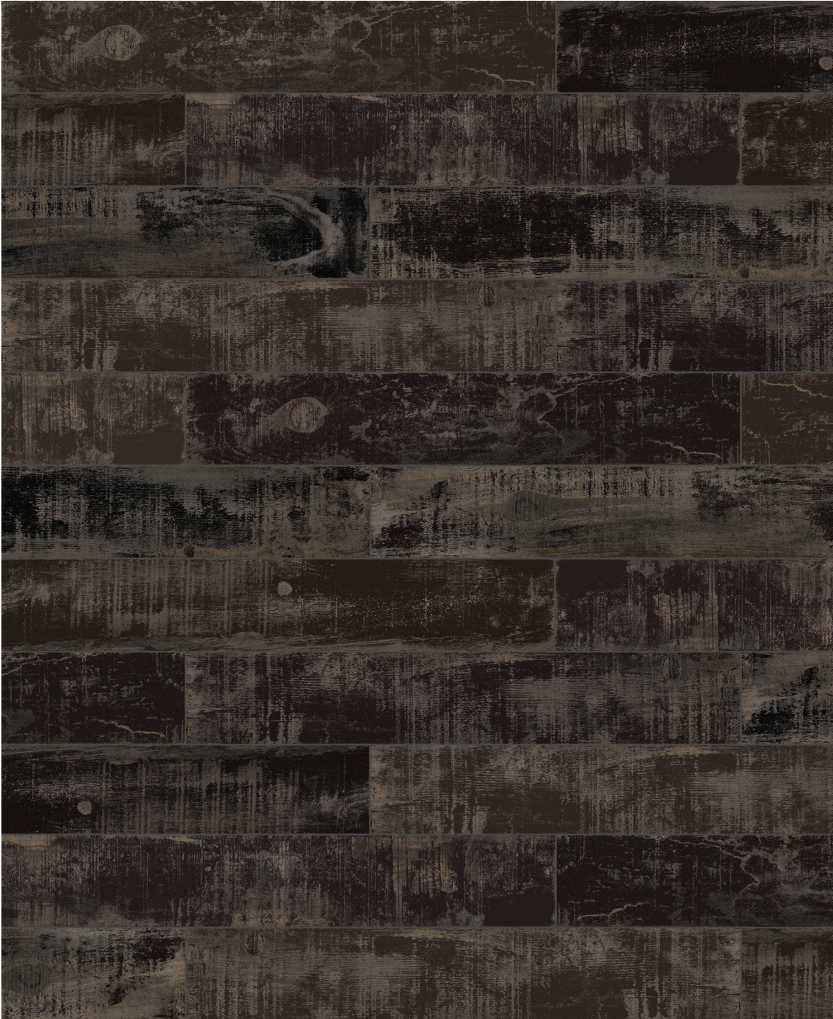
6" x 36" RECLAIMED CHARRED HD PORCELAIN TILE