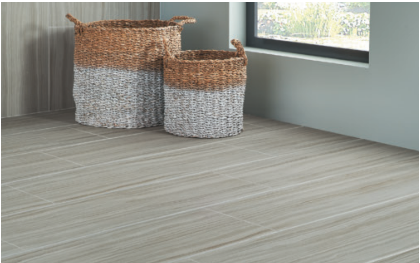
JAV03 ▶ House Blend 12 x 24

Information listed here is subject to change. Please refer to CrossvilleInc.com for the latest, most accurate information.