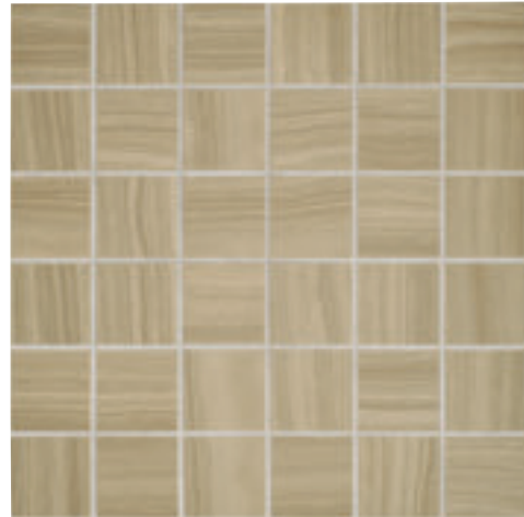
JAV02 ▶ Flat White 2 x 2 Mosaics