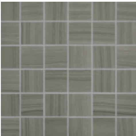
JAV05 ▶ French Press 2 x 2 Mosaics