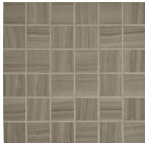
JAV04 ▶ Fresh Ground 2 x 2 Mosaics