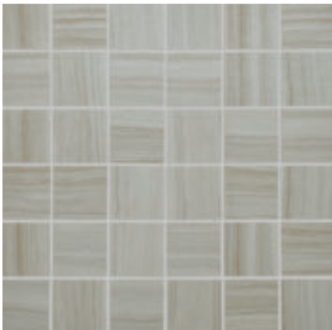
JAV03 ▶ House Blend 2 x 2 Mosaics