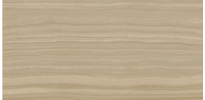
JAV02 ▶ Flat White