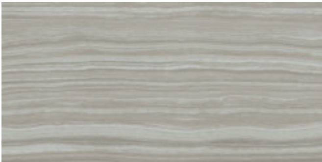
JAV03 ▶ House Blend