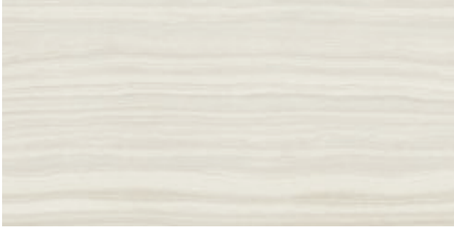
JAV01 ▶ Two Sugars