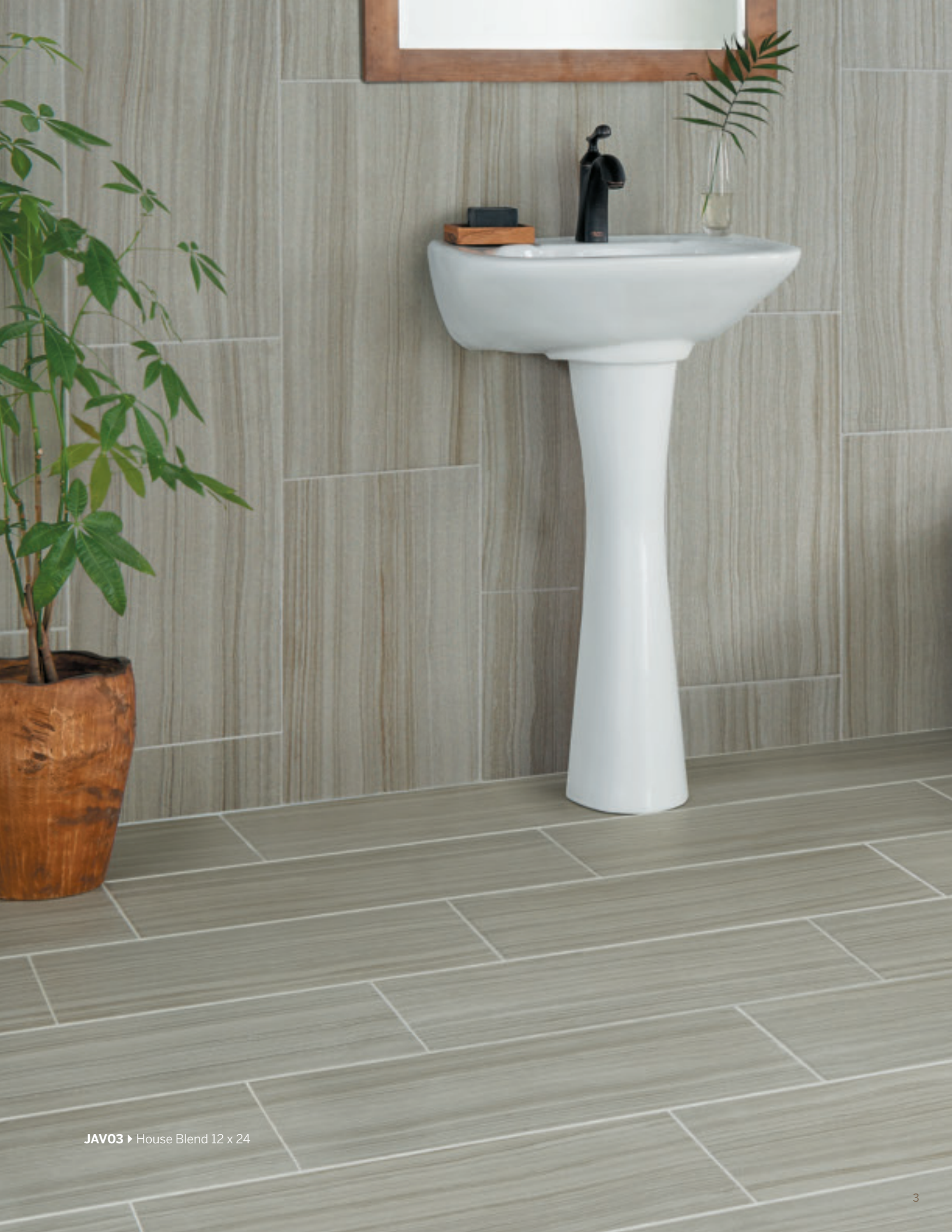
JAV03 ▶ House Blend 12 x 24