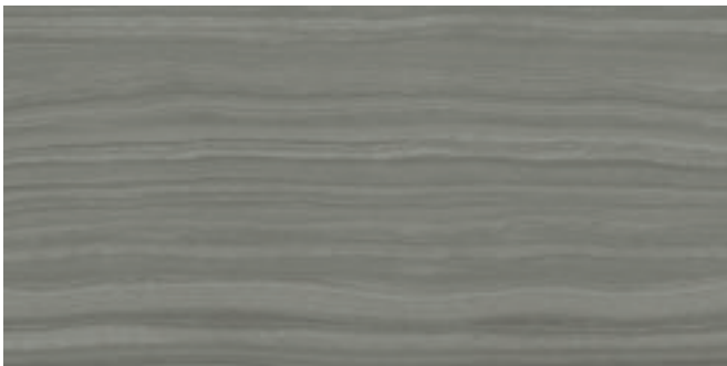
JAV05 ▶ French Press