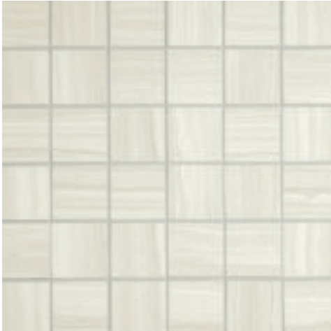
JAV01 ▶ Two Sugars 2 x 2 Mosaics