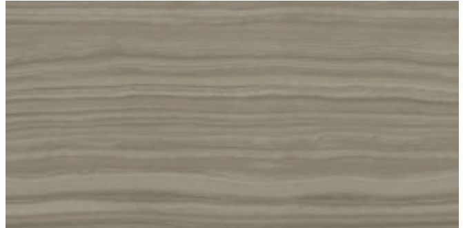
JAV04 ▶ Fresh Ground