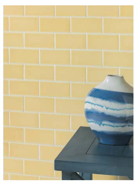
HWR07 ▶ Gold Leaf 3 x 6 Gloss