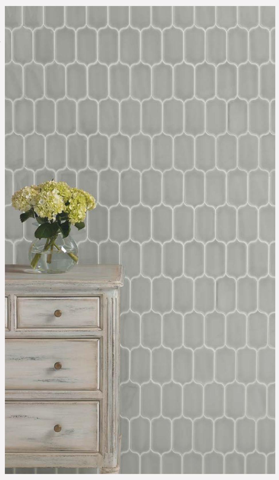
HWR03 ▶ Private Affair 3 x 6 Gothic Picket Gloss