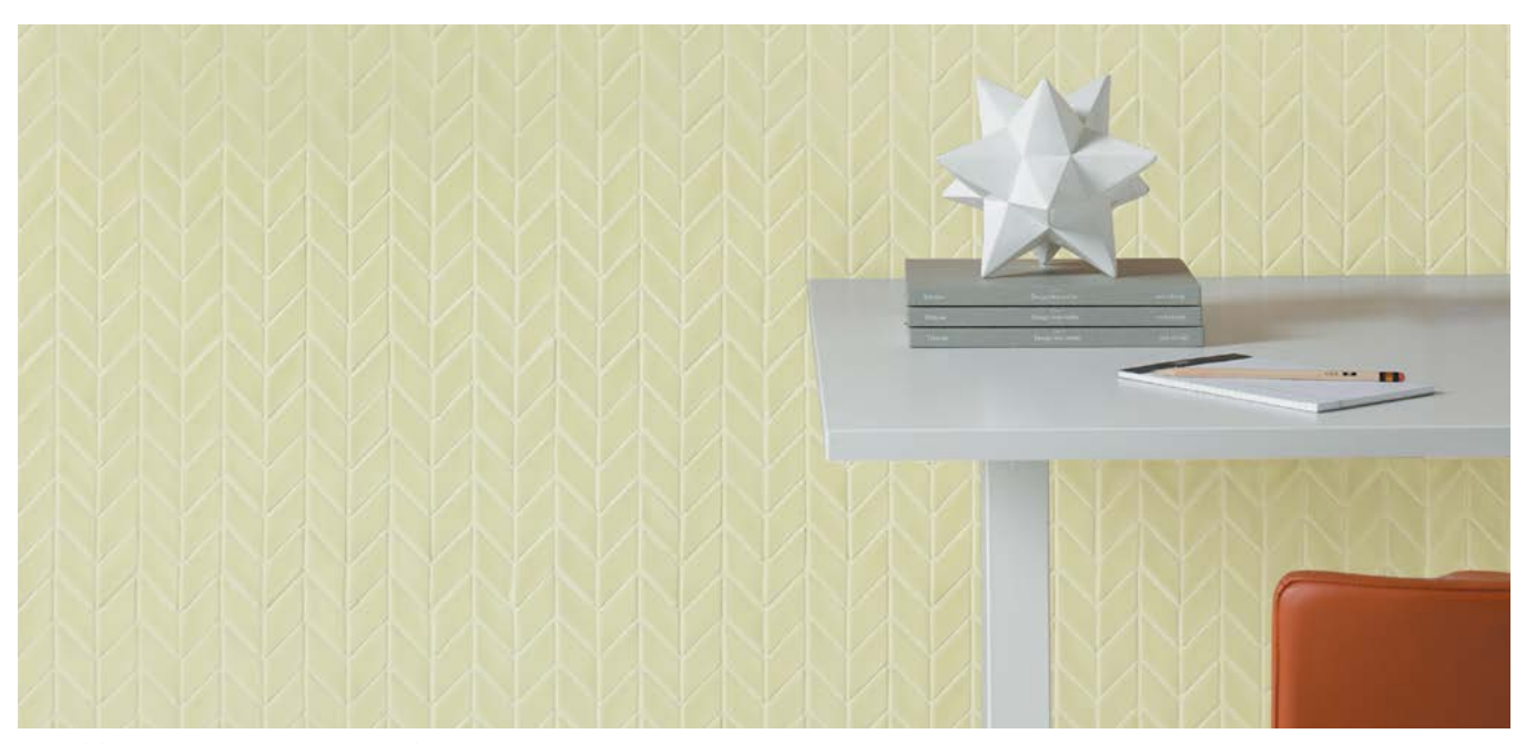
HWR06 ▶ Pen Pal Diamond Mosaic Gloss

If you want a better idea of what Crossville tile would look like in a particular room setting, simply visit our website and click on Cross-Vision. This powerful software tool allows you to visualize different types of Crossville tile. In addition, you'll find comprehensive information about Crossville's entire portfolio of products. You can also learn about the latest styles and trends from industry experts, download detailed care and maintenance instructions for our various products, or browse electronic versions of Crossville's product brochures. So whether you need information about Crossville products or tile in general, please visit us at CrossvilleInc.com.