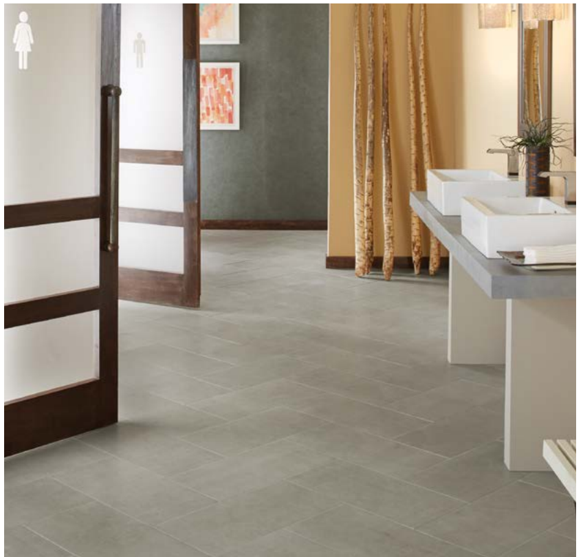
AV323 ▶ Clock Tower 12 x 24