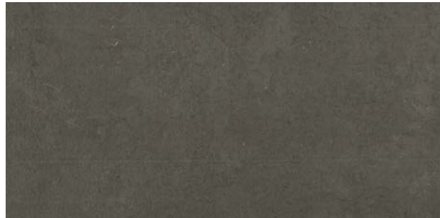
AV326 ▶ Pavement