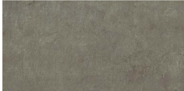
AV324 ▶ Mainline