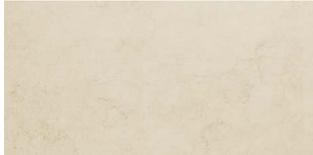
AV322 ▶ Penthouse